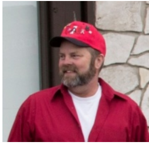
Something from the road.